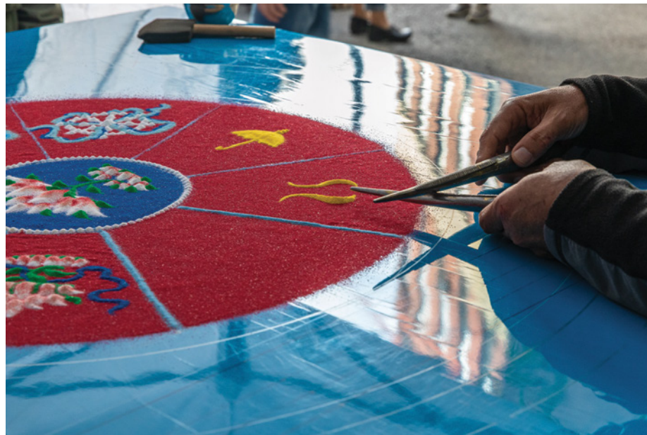
Bottom right: Persistence dedication, November 1, 2019.