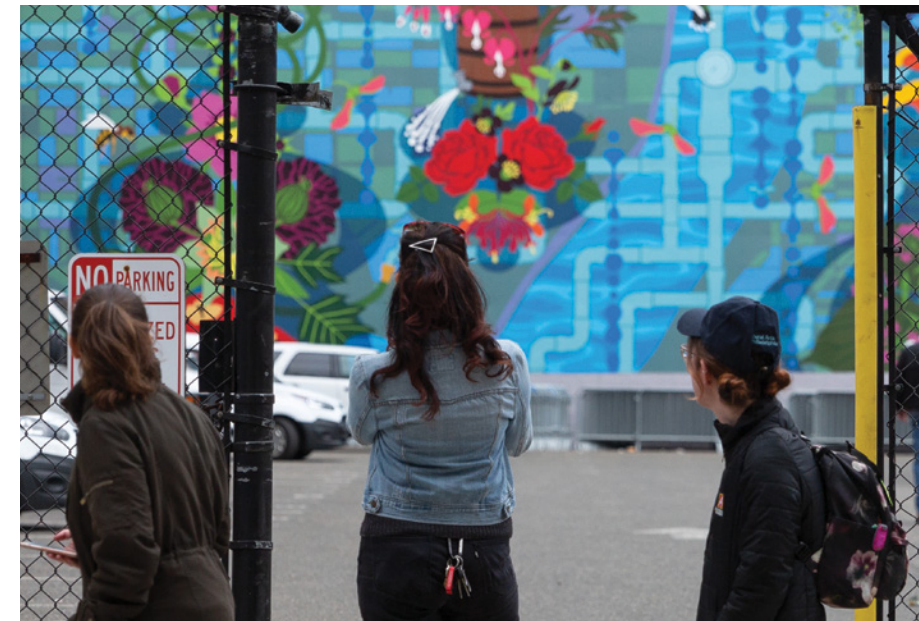
Bottom: Mural Mile walking tour, April 2, 2019.