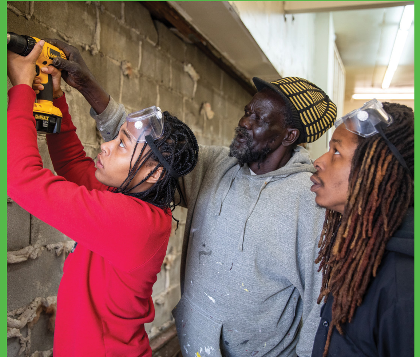
Guild carpentry workshop at the former Shooter Shop in Kensington/Harrowgate.

one-year recidivism rate, compared to 35% city and statewide