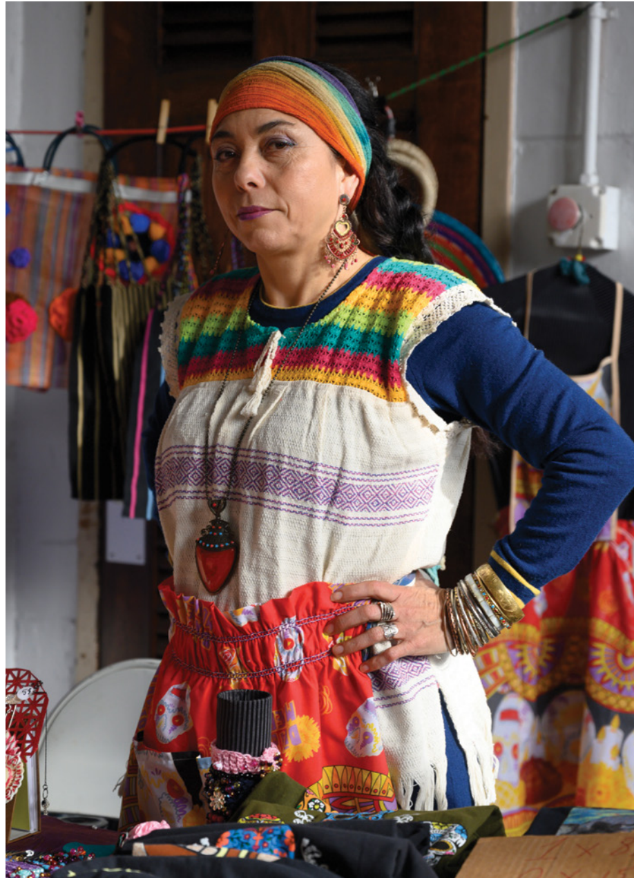
Top left: Southeast by Southeast Holiday Sale at the Bok Building in South Philadelphia, December 21st, 2019.