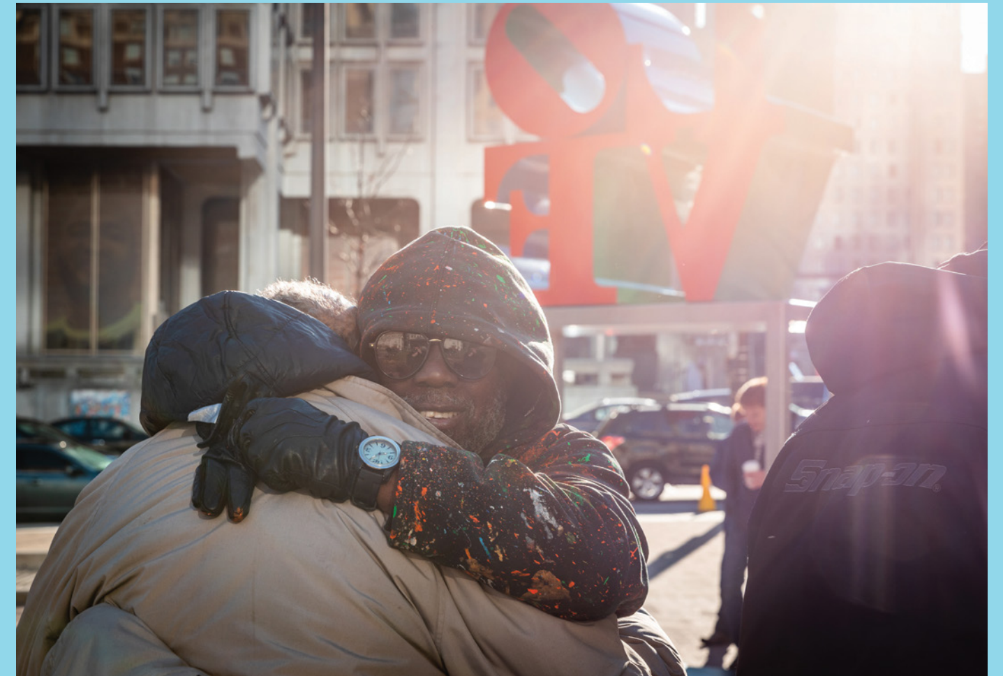
Color Me Back Lottery process in Love Park, March 5, 2020.

languages and dialects spoken by program participants