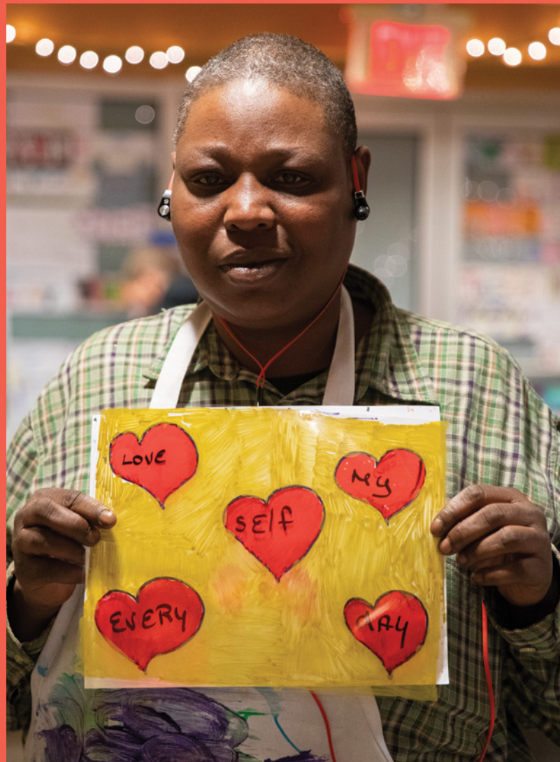
Color Me Back participant with her artwork in Suburban Station, March 5, 2020.

It's more important now than ever that we band together. As Mural Arts moves quickly in this new landscape to address the needs of the City of Philadelphia, our partner organizations, and the many individuals we support, know that we cannot do this meaningful work without you.