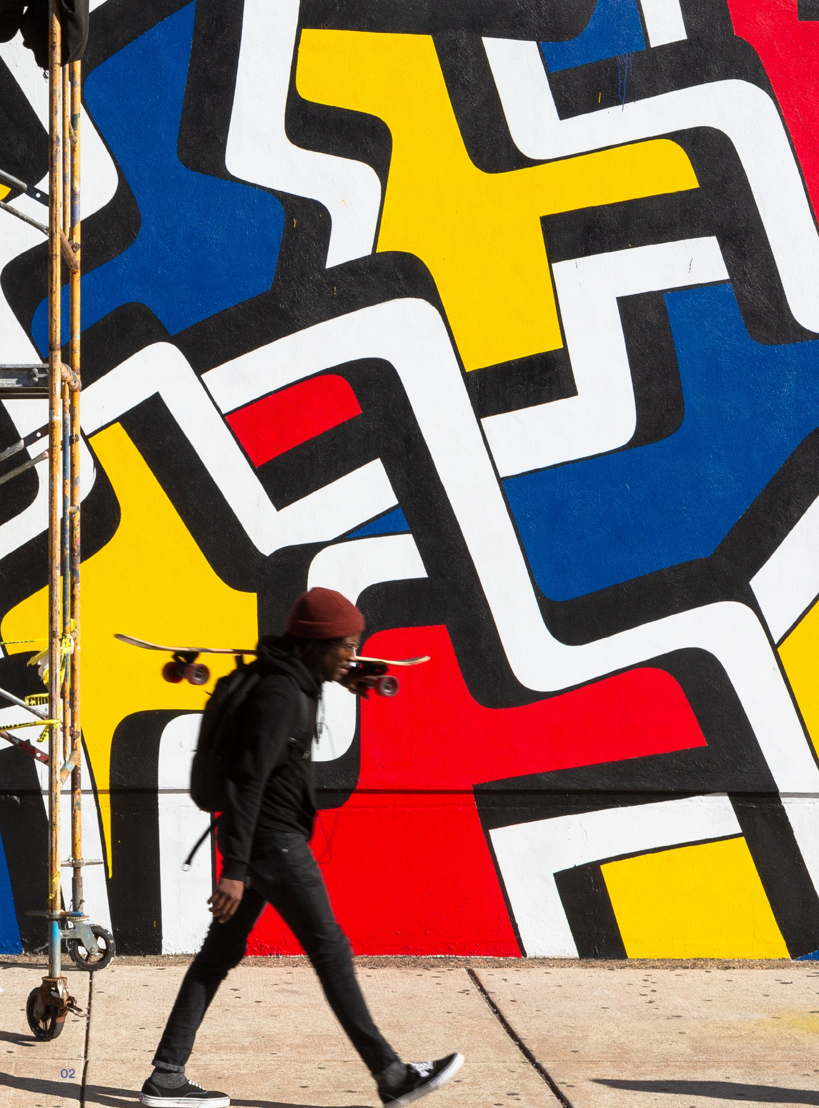
Primary Dispersion by Isaac Lin, in-process.

Sometimes people ask if we have run out of walls. We have not. For every concrete surface that we find in Philadelphia, many more barriers are out there facing vulnerable and marginalized communities.