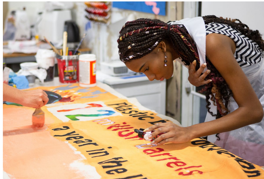
Bottom right: Trades for a Difference © 2018 City of Philadelphia Mural Arts Program / Felix St. Fort, 6812 Chew Avenue.