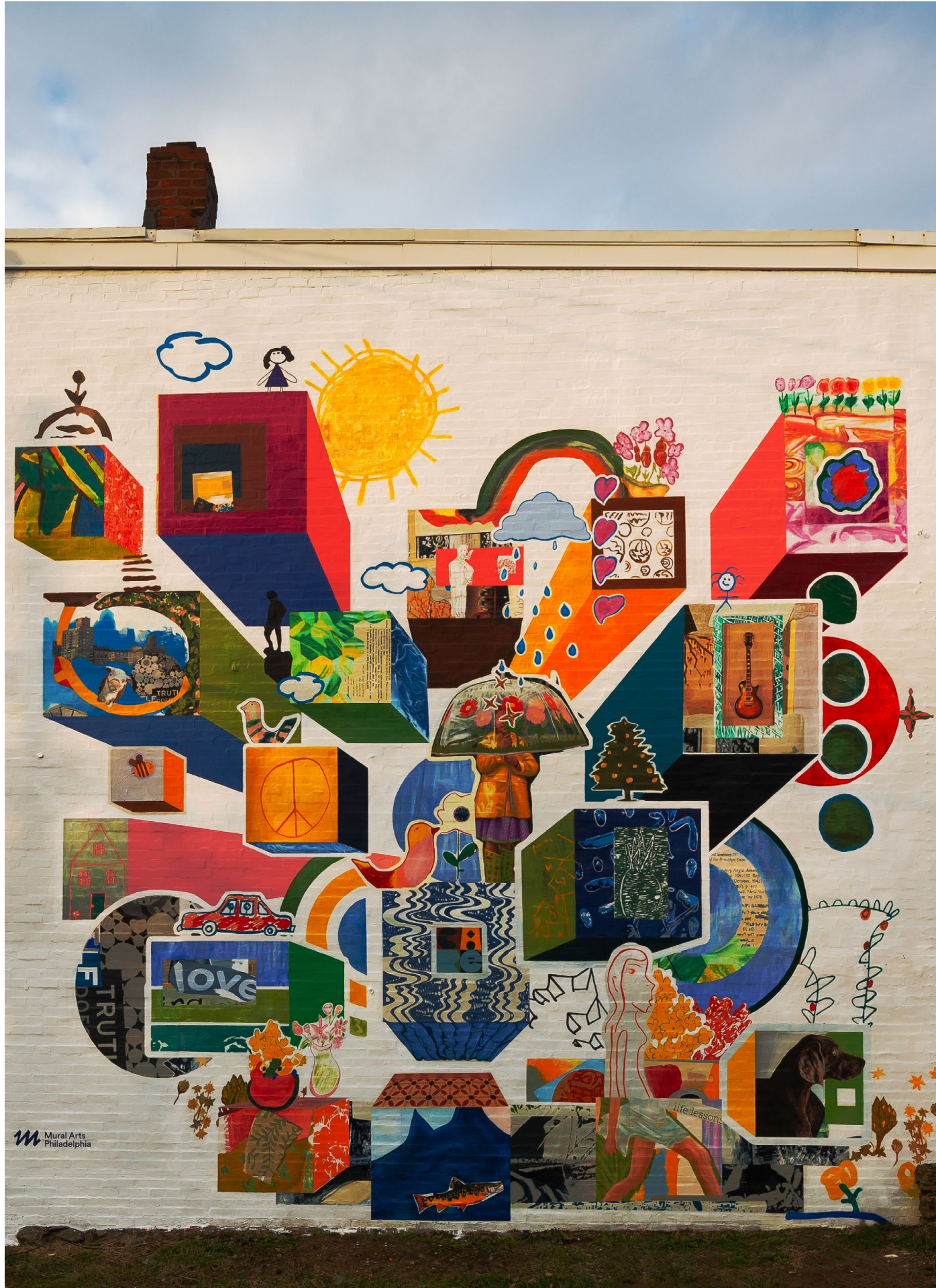
Left: A Collection of Creative Decisions © 2018 City of Philadelphia Mural Arts Program. James Burns, 5741 Wister Street.