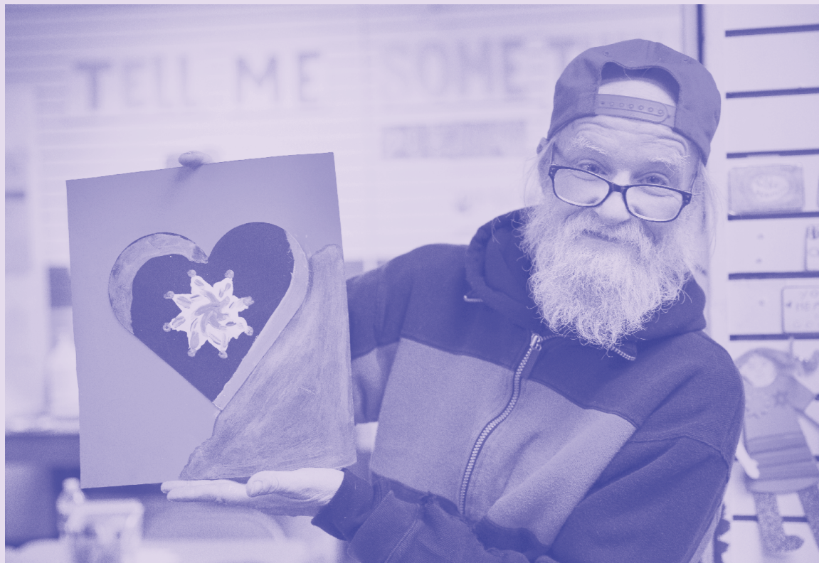
Previous page: Trash Academy Summer Campaign, August 1, 2018.