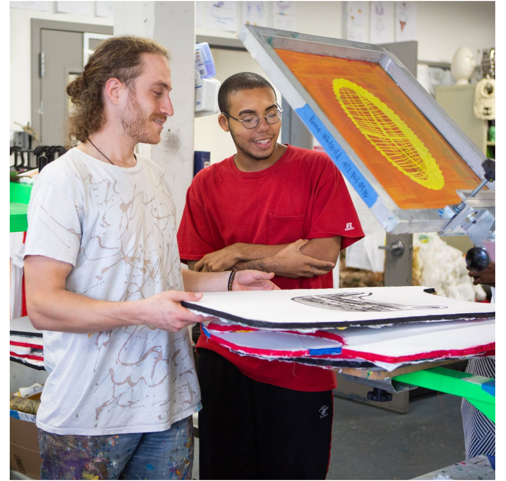
Bottom right: Water Gives Life