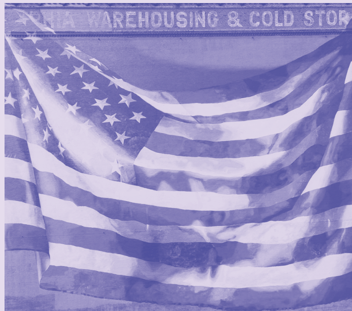
Jack Bogle's favorite mural, Our Flag Unfurled, 500 N Columbus Blvd.

I have met many people over my 35 years of working in Philadelphia, but among them, Jack Bogle was truly unique. I feel so honored to have known him. Despite his astounding accomplishments, he remained humble and gracious. What a role model for us all. Whenever I saw him, we would begin talking about Mural Arts and then quickly pivot to national and global issues. I learned from him all the time, even in short conversations over the years.