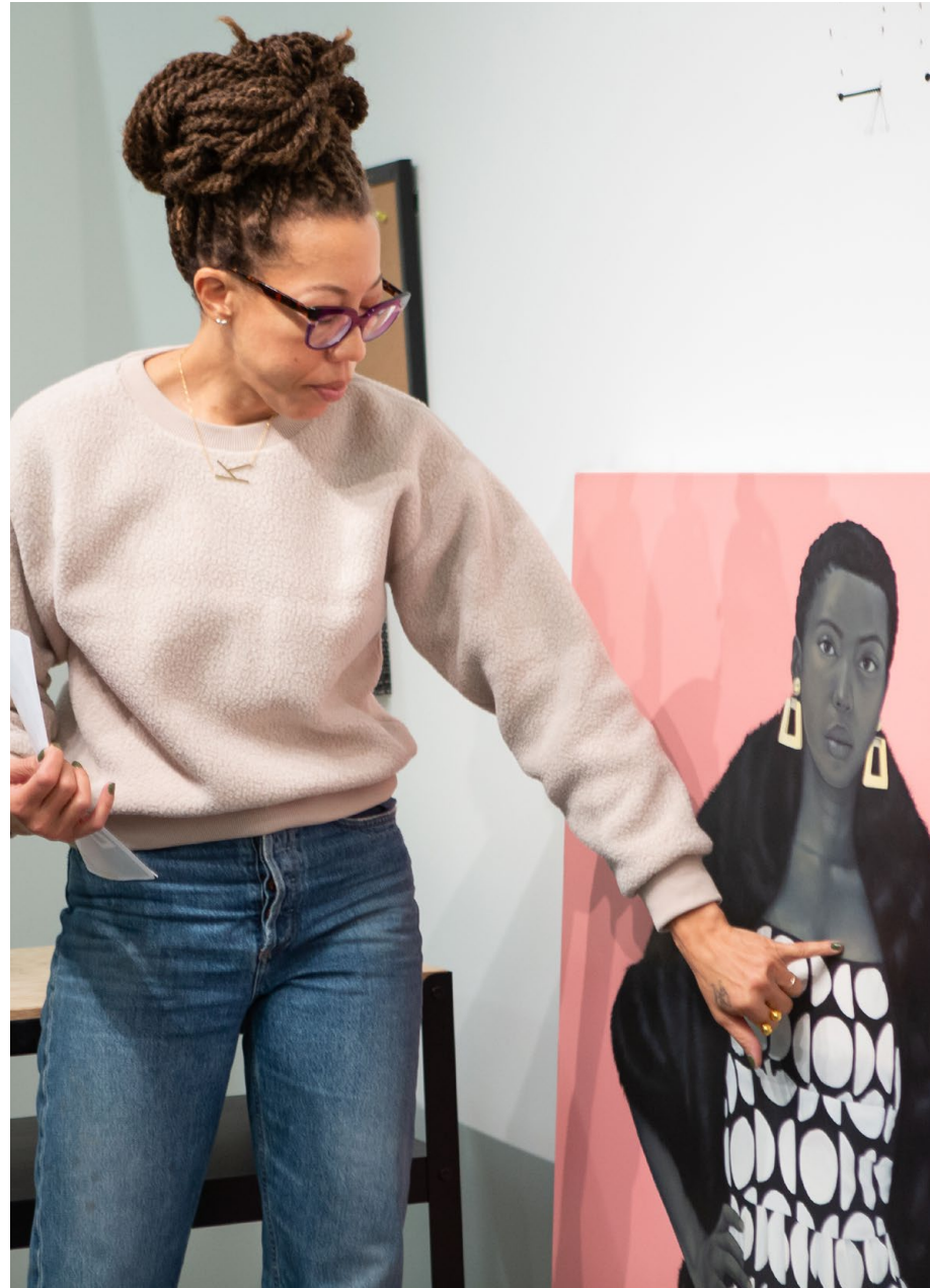
Top left: Amy Sherald in her studio.