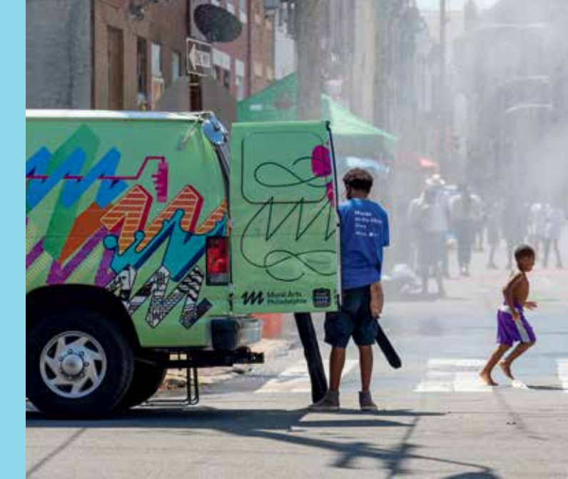
Far left: Boat People © 2020 City of Philadelphia Mural Arts Program / Claes Gabriel, 47th Street and Woodland Avenue.