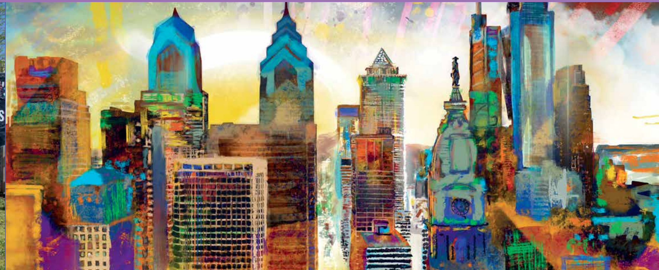
Philly Rising © 2021 City of Philadelphia Mural Arts Program / Nilé Livingston, interactive mural project.