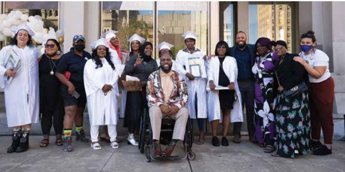
Above: Women's Reentry Pilot Project graduation ceremony at the Municipal Services Building, September 24, 2021.