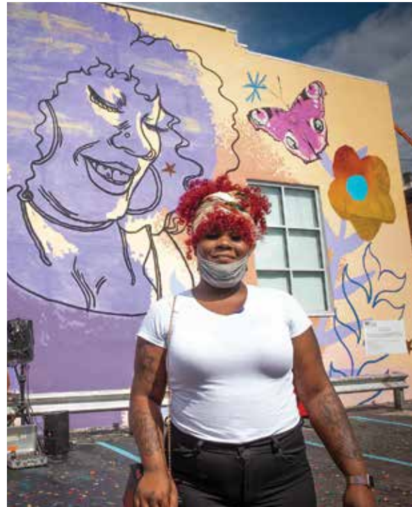
Left: We Are Universal dedication, September 28, 2021.

Mural Arts' Porch Light Department continued to work with Morris Home and its residents on a second project. Porch Light, with the support of the Department of Behavioral Health & Intellectual Disability Services, believes that continuity and impact comes by committing to a multi-year partnership with provider sites.