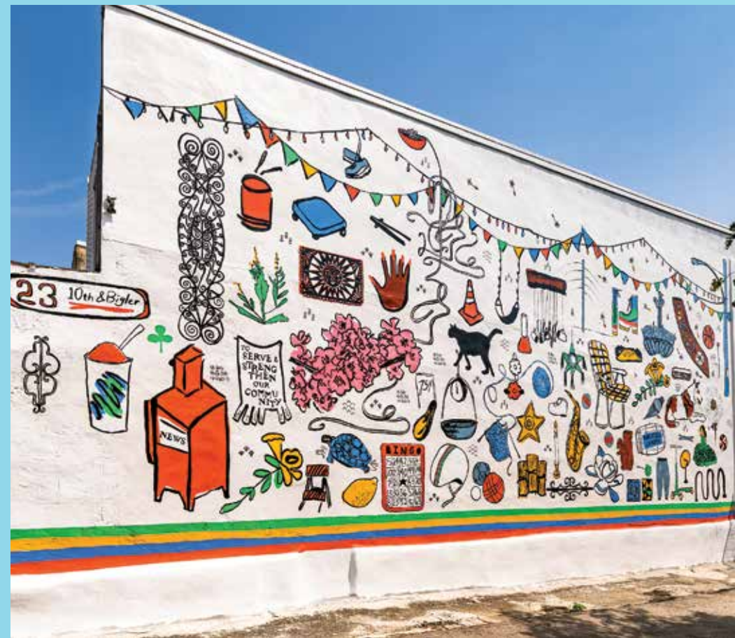
East Passyunk Bulletin Board © 2021 City of Philadelphia Mural Arts Program / Nottene Design Studio, East Passyunk Community Recreation Center, 1025 Mifflin Street.