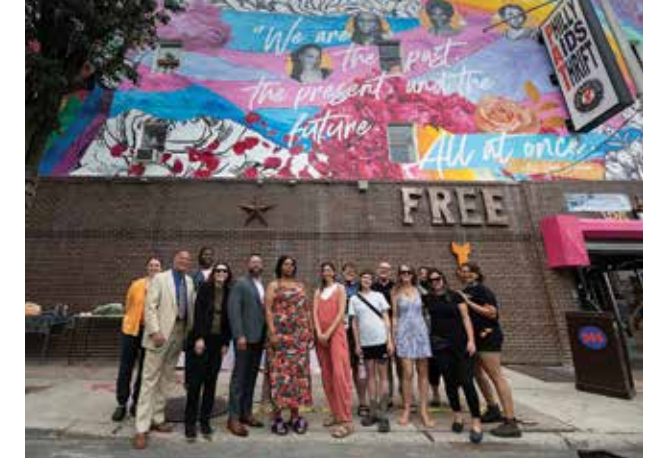
Left: All at Once dedication, June 21, 2022.