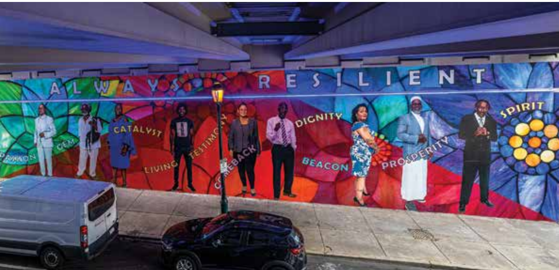
Top and bottom: Point of Triangulation: Intersection of Identity © 2021 City of Philadelphia Mural Arts Program / Michelle Jones & Deborah Willis, 21st Street & JFK Boulevard.

Point of Triangulation: Intersection of Identity was a series of paired portraits mounted in the Reimagining Reentry Fellowship Exhibition at the African American Museum. Each pair of portraits hinged on a 90-degree angle, extending around the viewer. On one side, individuals wear carceral clothing - white t-shirts and gray pants. On the other side, they wear the attire of their choice. When stepping on a red line on the floor to complete the triangle, the viewer is challenged to explore their biases and assumptions, in particular the tendency to weaponize stigma and oversimplify identity, or to distill a complex being to a single part of their lives. This project was expanded into a mural, located at the underpass on 21st Street & JFK Boulevard, which allows viewers to stand between both depictions of formerly incarcerated people. The entry and exit points evoke themes of reentry into society from incarceration, as well as a choice between two paths: to further stigmatize people who have been incarcerated or to create a society that truly reflects a belief in second chances. The mural was dedicated on October 5, 2021.