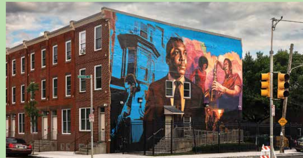
Why We Love Coltrane, 2729 West Diamond Street.