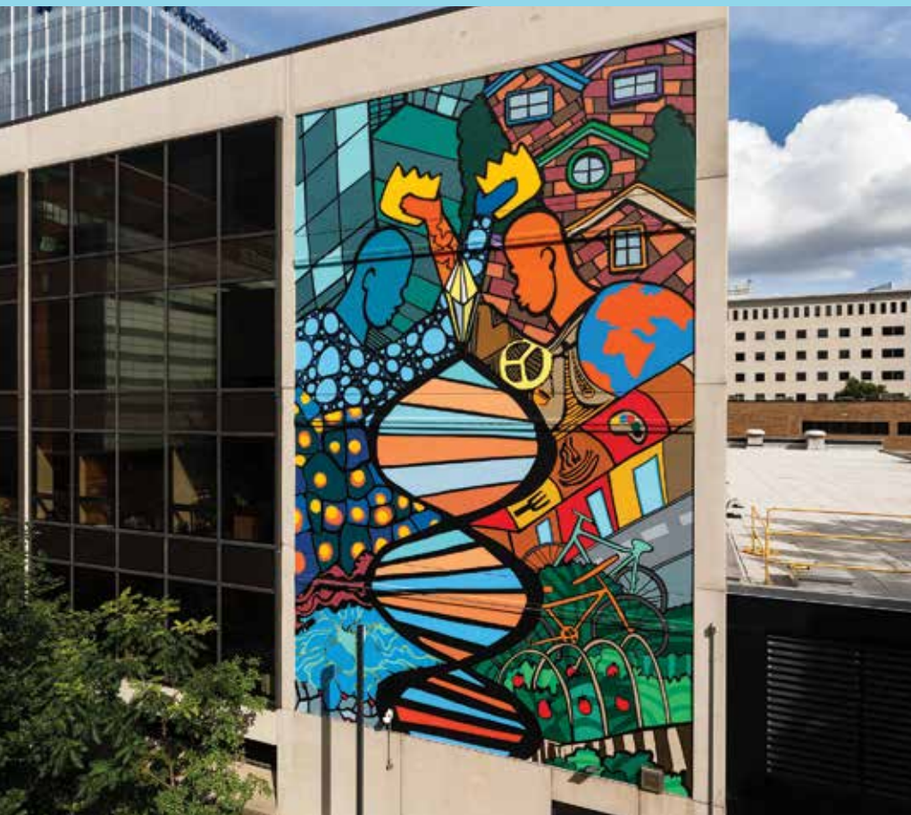
In Majesty © 2021 City of Philadelphia Mural Arts Program / Femi Olatunji, 3624 Market Street.