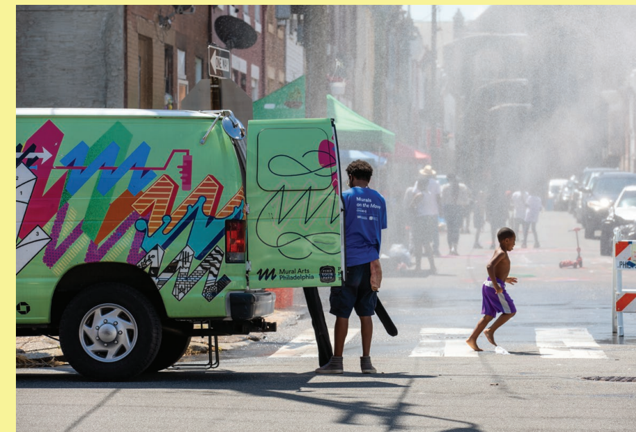
Top: Expression Session with The Kensington Voice, March 6, 2020.