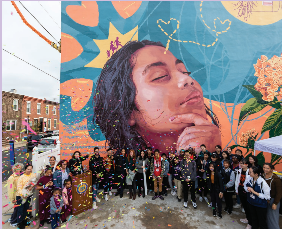
Migrant Imaginary dedication, October 29, 2019.