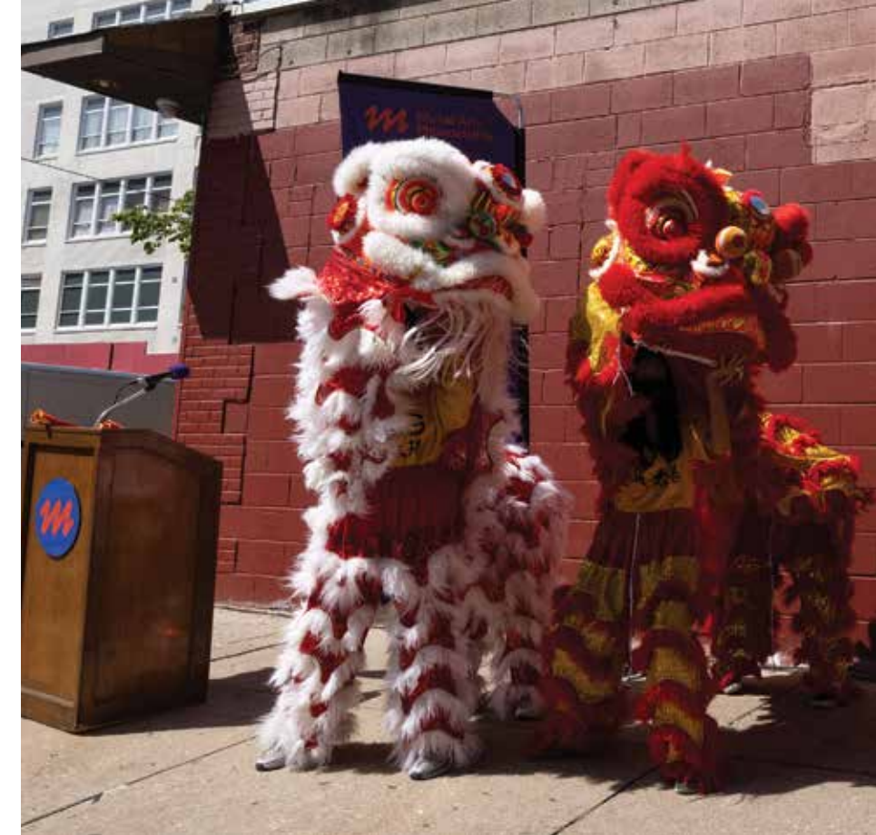
Left: We dreamt an orchard this way dedication, May 10, 2023.

Through the AAPI mural series and their deeply impactful work at Southeast By Southeast, Porch Light is committed to amplifying the voices of AAPI communities. These ongoing projects will help these communities to fully engage Philadelphia and make it truly feel like home.