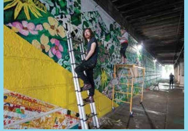
Emerald Street underpass mural in-process, July 8, 2022.