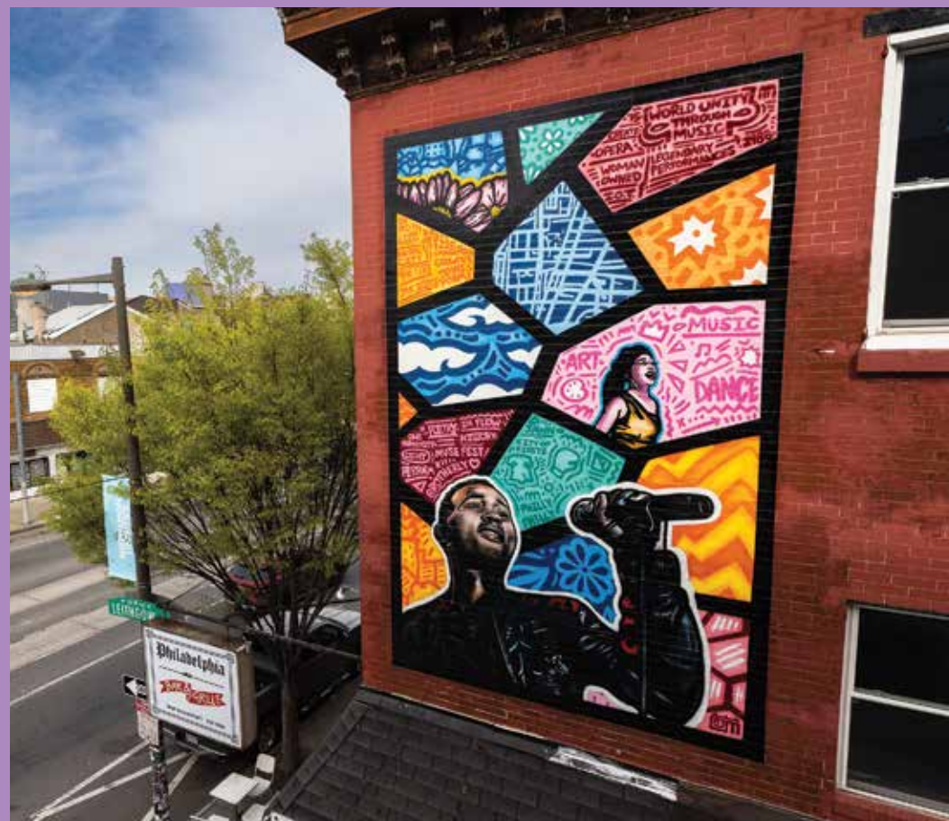
Legendary Performances © 2023 City of Philadelphia Mural Arts Program / Alloyius McIlwaine, The Fire, 412 West Girard Avenue.