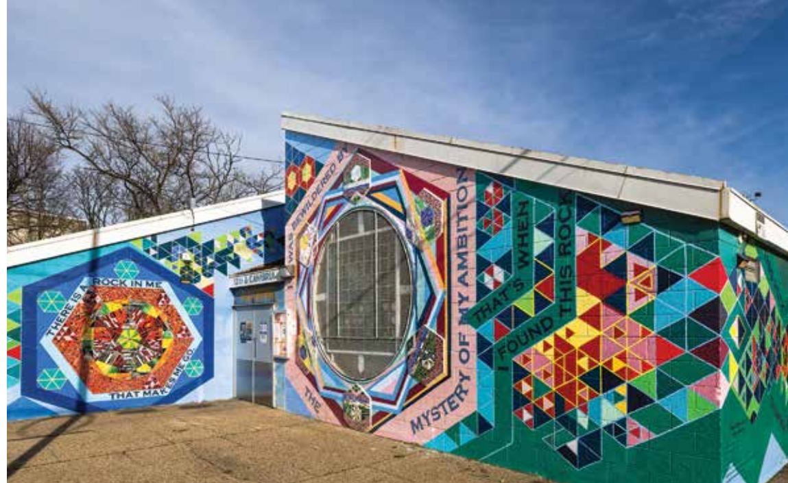
Top: The Garden (restoration) © 2013 City of Philadelphia Mural Arts Program / Delia King, 12th & Cambria Recreation Center.