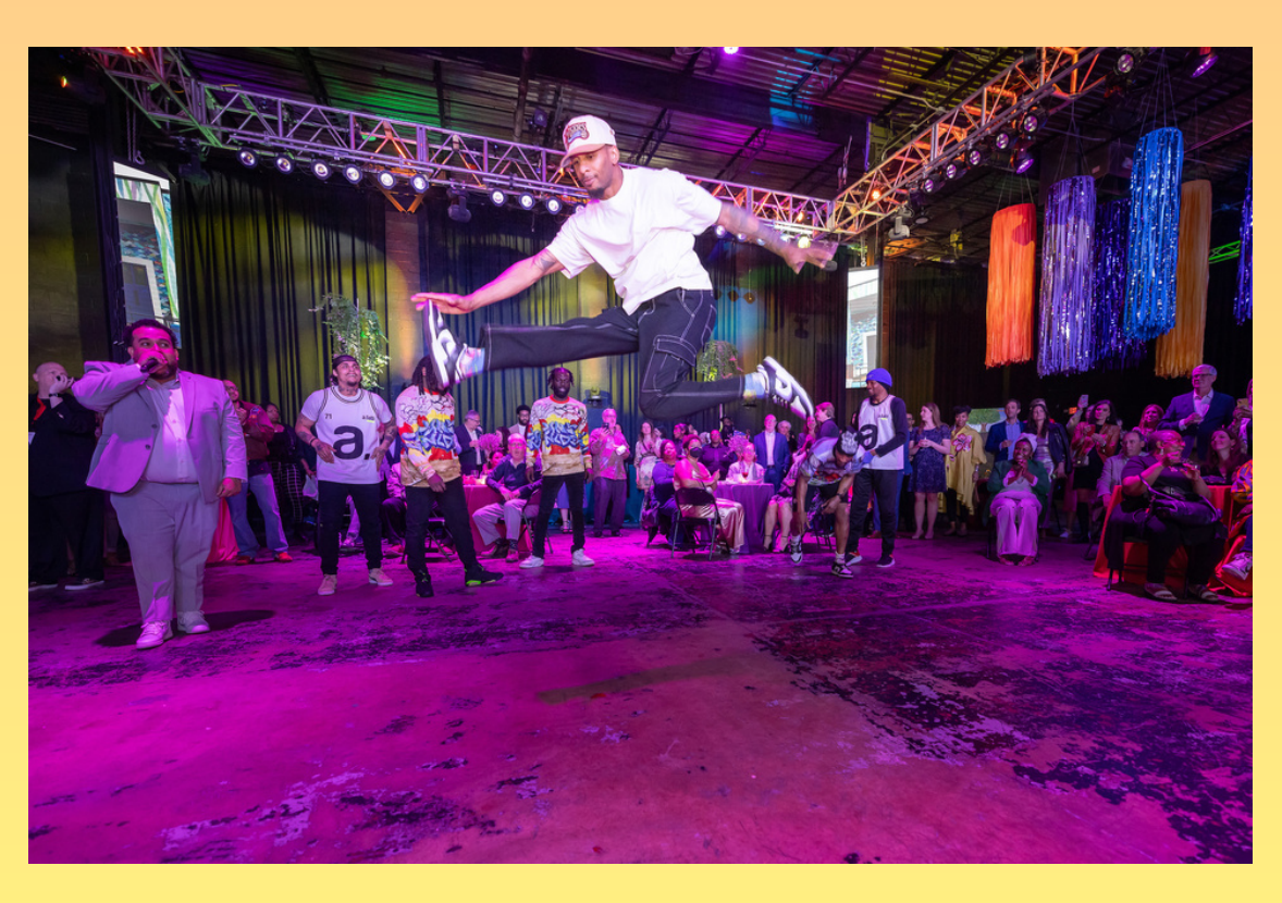
Wall Ball 2024, May 3, 2024, 2300 Arena.