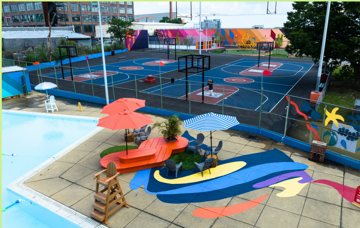
Photo Credit: Family Interrupted Restoration, 2024. SwimPhilly: Scanlon Rec Center, 2023. Photos by Steve Weinik

Mural Arts' Restorative Justice programs are transforming lives and communities. By fostering creative expression and providing vital support, they empower individuals impacted by the justice system. From their pioneering work at SCI-Phoenix to the innovative Reimagining Reentry Fellowship, Mural Arts is leading the way in reimagining the criminal justice system. These programs not only provide artistic and professional development opportunities but also cultivate a deeper understanding of the systemic issues that contribute to mass incarceration.